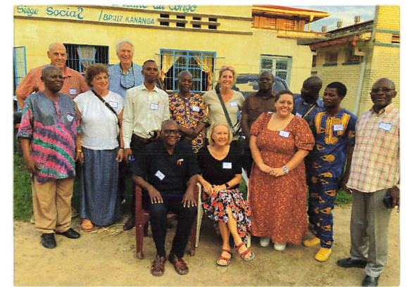
CPC partners welcomed visitors to girls' schools from Myers Park Presbyterian Church in 2023.

Equipping Congolese Youth for the Future