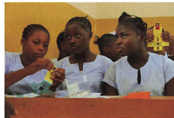
Students learning how to use a fold scope in science class