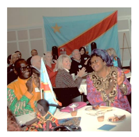
For more information about the Congo Ministry at Myers Park Presbyterian Church, visit myersparkpres.org/congo